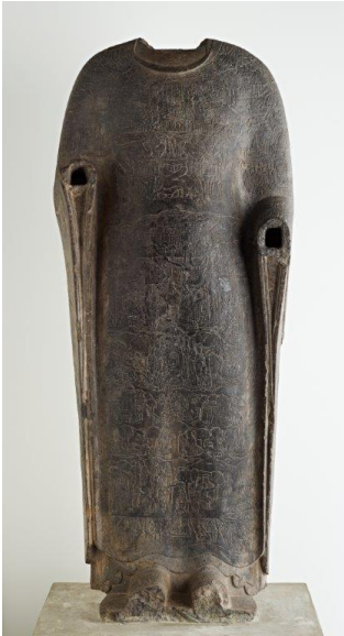
Cosmic Buddha China, Northern Qi dynasty, 550-577 Limestone 151.3 x 62.9 x 31.3 cm Freer Gallery of Art, F1923.15