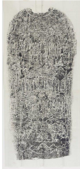
Rubbing from Stone Statue of Buddha 20 th century Ink on paper 144.3 x 77.7 cm Gift of Peking University, Freer Gallery of Art, F1980.86.1b