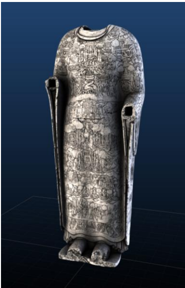
3D scan of Cosmic Buddha with digital surface occlusion.