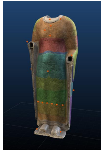
3D scan of Cosmic Buddha highlighting hot spots and zones.